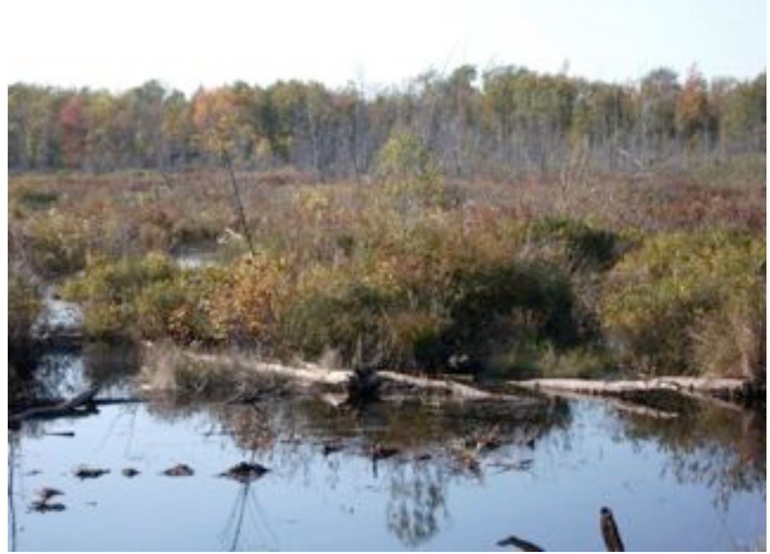
View from new blind to viewing tower.

<u>WEB SITE -</u> Our web site is in the process of being updated. Stay tuned for some wonderful changes. The newsletter will continue to be posted on the web, as well as emailed and mailed to non-computerites. You can still find us at <u>www.friendsofmacgregor.org</u>